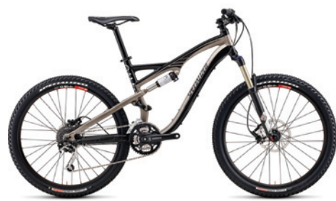
Specialized Camber Elite mountain bike