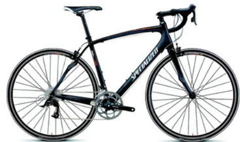
Specialized Roubaix Elite road bike

Brand-spanking new road or mountain bike from Specialized and Outside Sports, Queenstown!